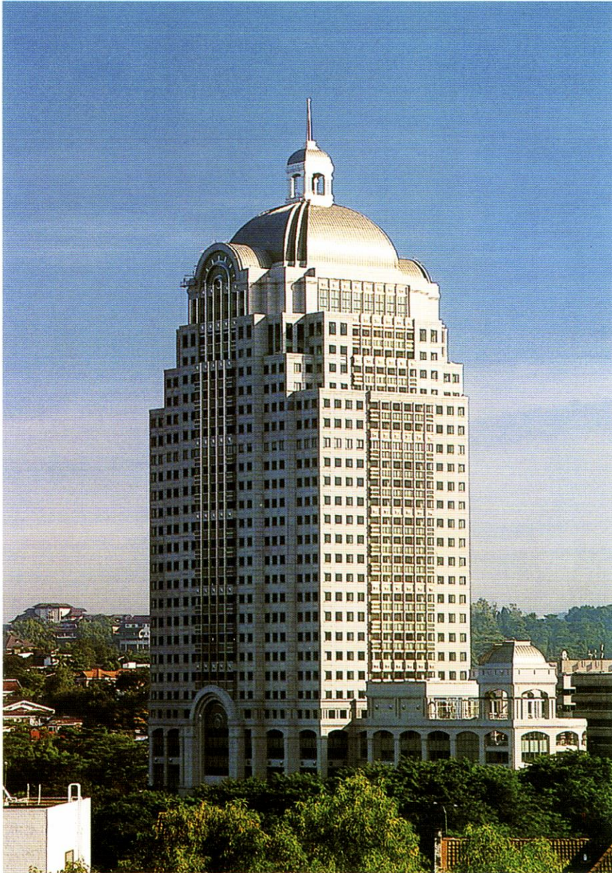
Damansara City, Kuala Lumpur, Malaysia