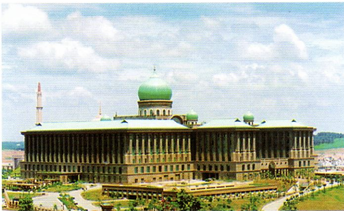
Prime Minister's Office in Putrajaya, Malaysia.

Flat seam joint of 30mm width Tile width max. 500mm Tile length max. 4000mm Minimum radius for convex/concave curved roofs = 500mm Minimum roof pitch 25 deg.